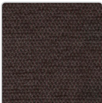
S870 DARK BROWN