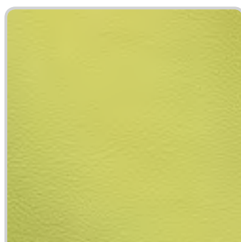
ML684 NEW CELERY